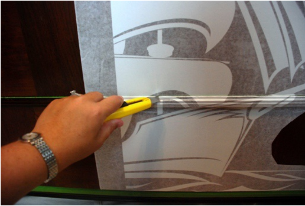
Step 6 – remove top layer of decal, leaving decal in place