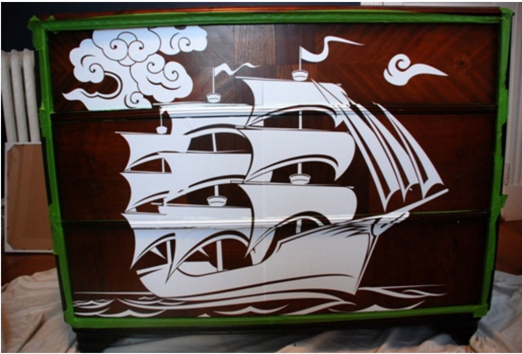
Step 8 - lightly sand dresser, try to avoid sanding over the decal