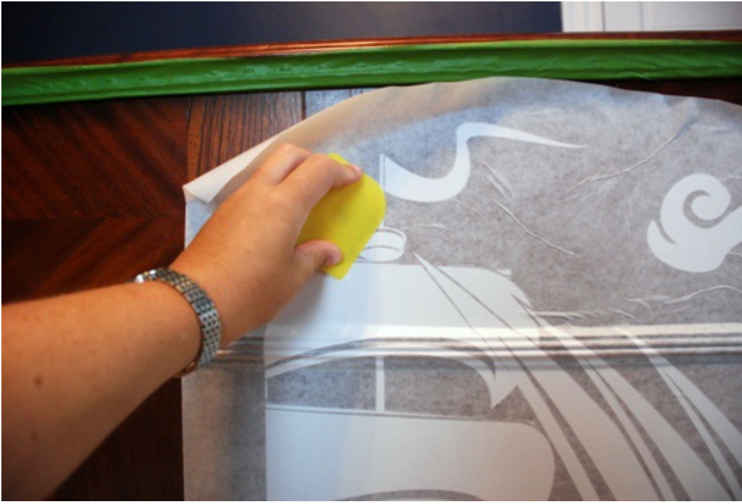
(smoothing out the decal)