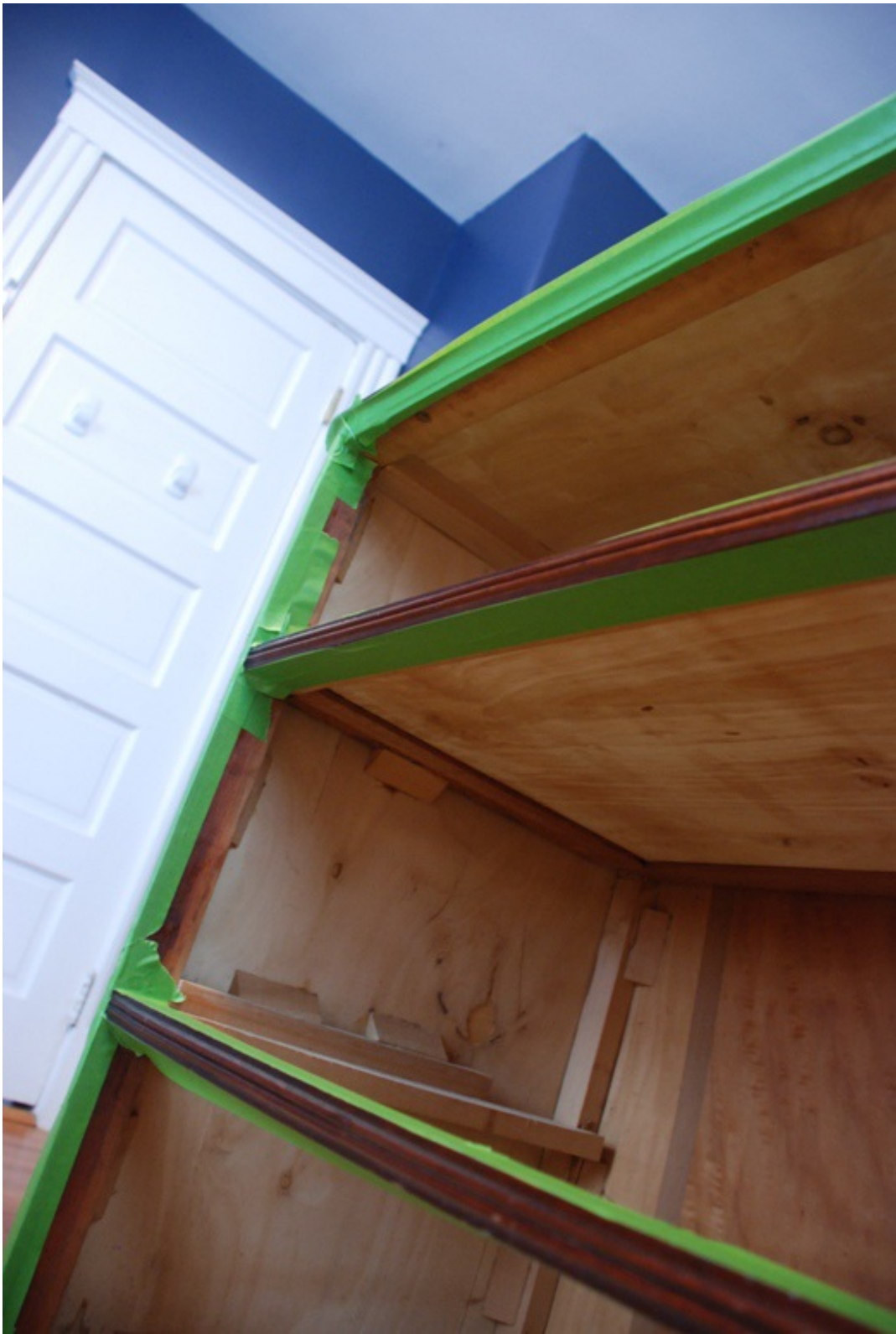
Step 2 – remove hardware and tape out the edges of the drawers themselves