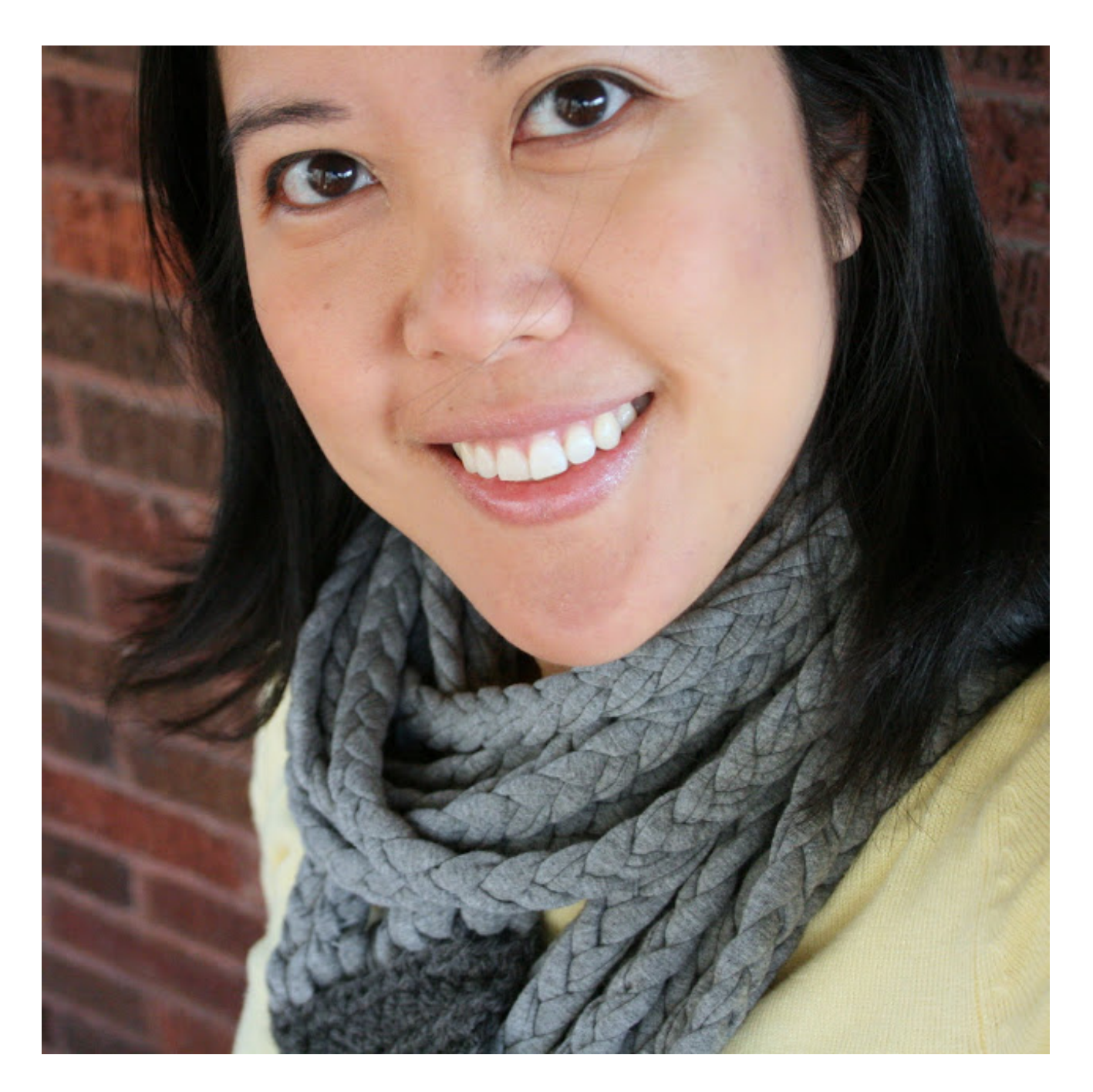
Ok! NOW I can sit down and seriously think about my resolutions for 2012! [Update]: I got myself a sticker!