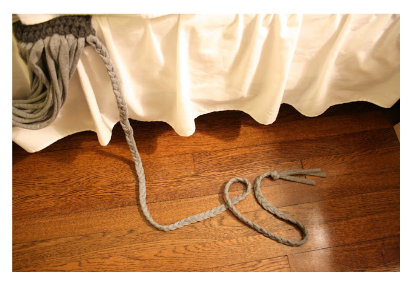
Braid, sip wine, braid some more. Chug wine. Keep braiding. Before you know it, you'll be done, and you'll have kicked that bottle and be feeling good!