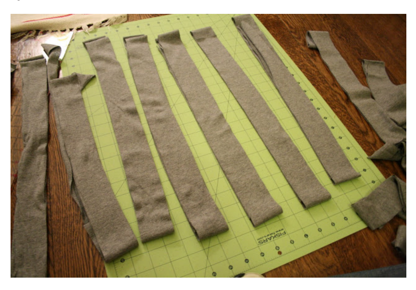
Since I had 2 yds of fabric, my strips were 72 inches long, but I needed twice that, so I sewed two strips together, to make 12 strips total. If you had 4 yds of fabric, you could cut some ginormous strips and save