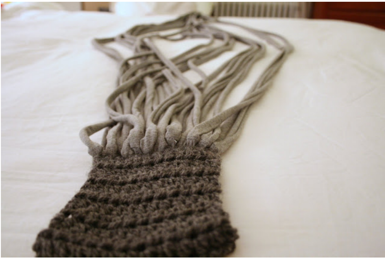
It's time to BRAID! Pick 3 noodles (that's 2 from each side of the first crochet hole and 1 from the second) to braid. At this point, save your sanity and roll the noodles up and tie with the hair bands. Otherwise, you'll be messing with 6 foot open ends, knots up to your eyeballs, and no amount of liquor is going to make you want to continue.