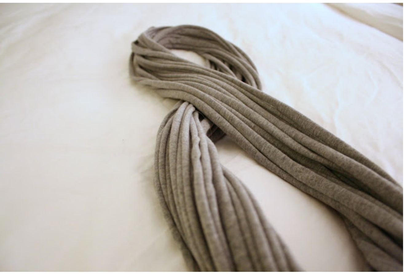
Thread the 12 noodles into 12 holes at the bottom of your crochet cuff so that the seam, or the middle, of the noodle is hidden by the cuff. This means you should have 6 feet of noodle on either side. Now you have a weird 12 pronged dodeca-pus squid monster.