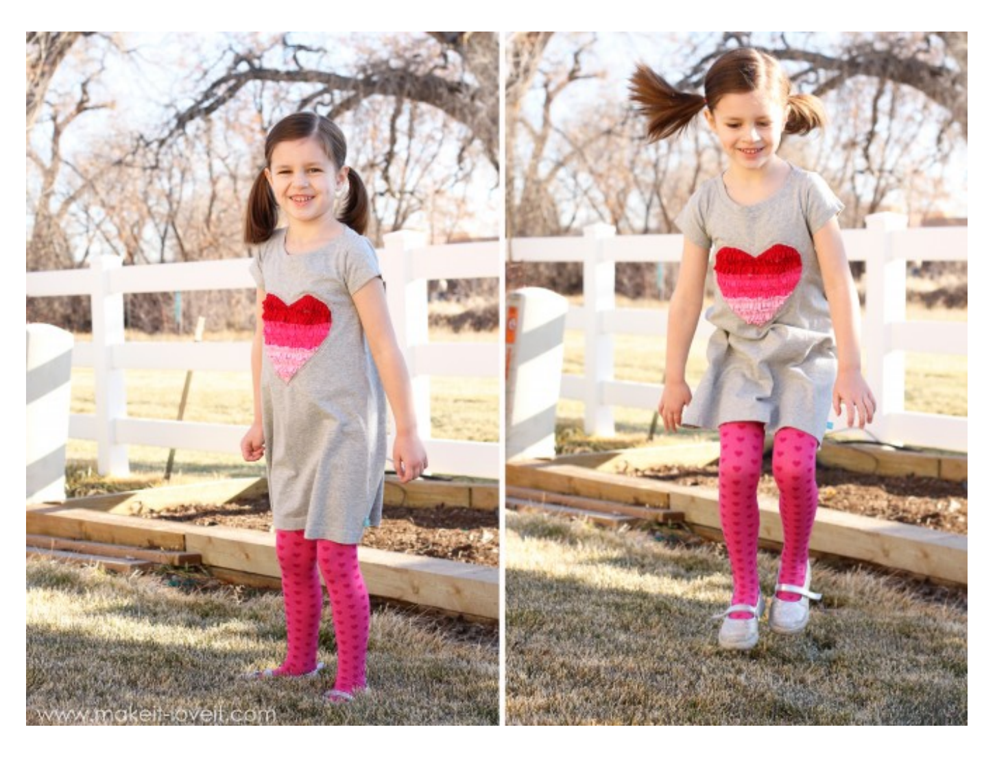
This girl loves purple and pink equally. So that big ruffly heart made her grin.