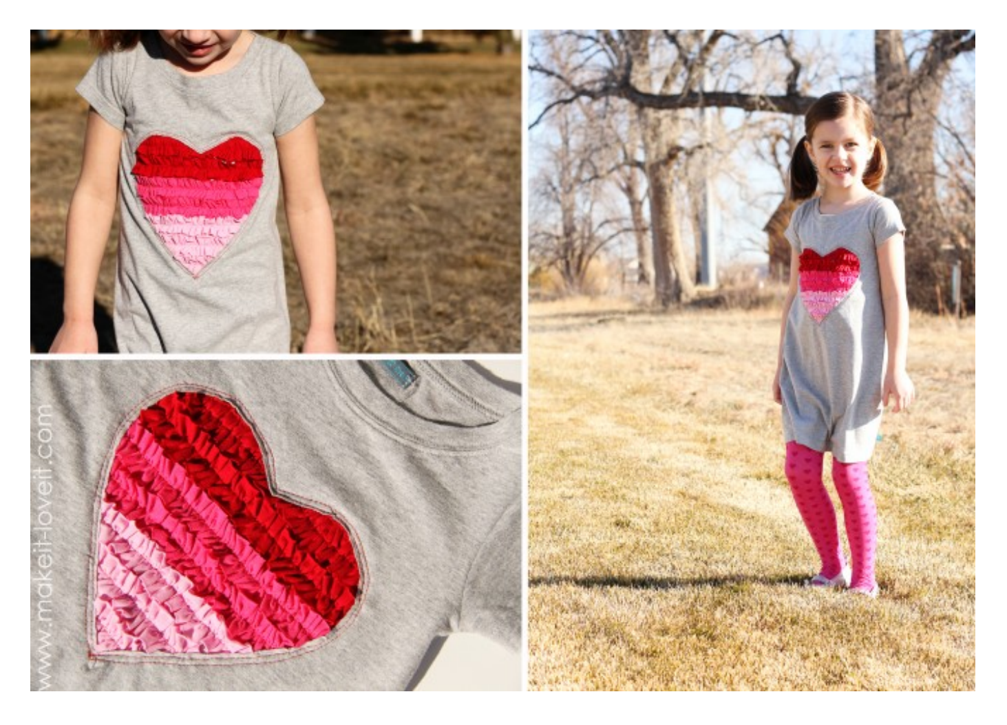
And since her momma can't stand not making new things, especially out of clothing outcasts ......she got a new outfit.

I know we don't need a new outfit for every holiday......but for some reason, it makes the whole day a lot more fun .