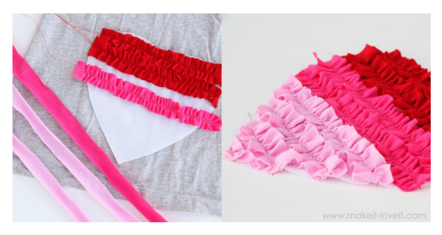
Once all your strips are sewn down, trim off the extra fabric around the edges of your heart.

Then cut several strips out of your Tshirts (or knit fabric), whatever size you'd like. My strips were about 3/4 of an inch wide....but this can vary, depending on taste and the size of heart. And for the length, make then about 2-2.5 times longer than the area that they will be sewn to. So if your heart is 7 inches wide at the top, make your strip about 14 – 18 inches long. Then start gathering in your strips and sew them right down to your heart, sewing right on top of the basting stitch that gathered up your strip. (Need help with gathering? Click here.)