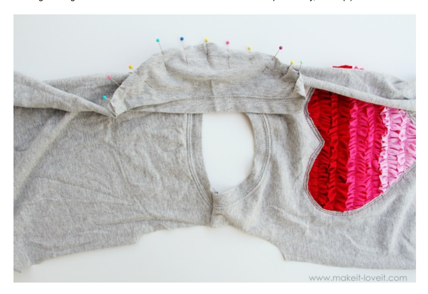
Sew both in place and then zig-zag.

stretching the edge of the sleeve or the dress to make them match up correctly, will help.)