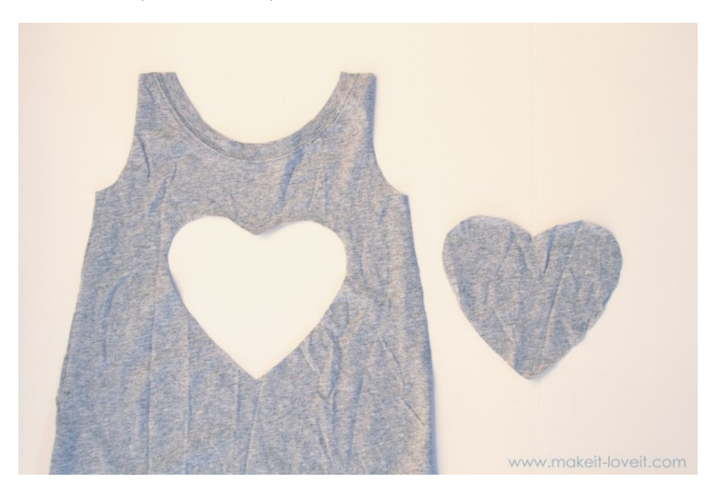
And then use the shape you cut out as a guide to cut a new heart out of some woven cotton fabric (which doesn't stretch and will make this next part a lot easier). Be sure to cut the heart out about 3/4 of an inch