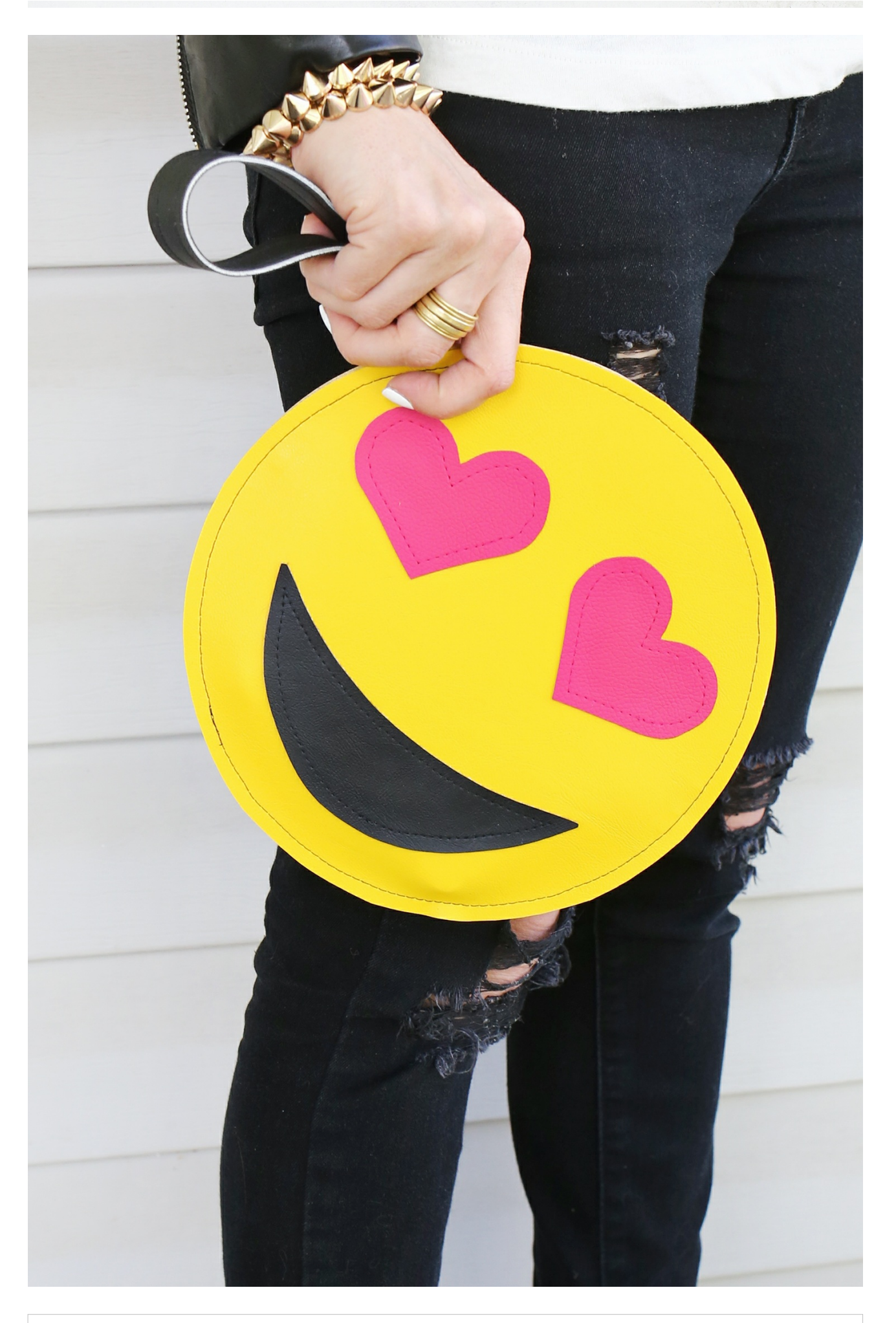
OMG! I want one! Emoji clutch DIY (click through for tutorial)